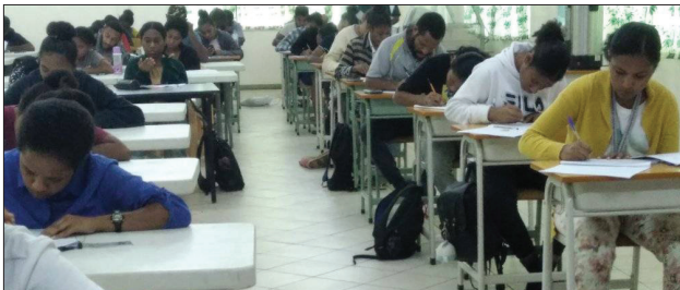
▲ First year students doing their Chemistry (STA: 113) exam this morning at the Hosea Turbarat Conference Hall.

Academic, technical and administrative staff have been hard at work preparing for the exams. The Campus This Week caught up with these ladies preparing Classroom 5 on Tuesday.