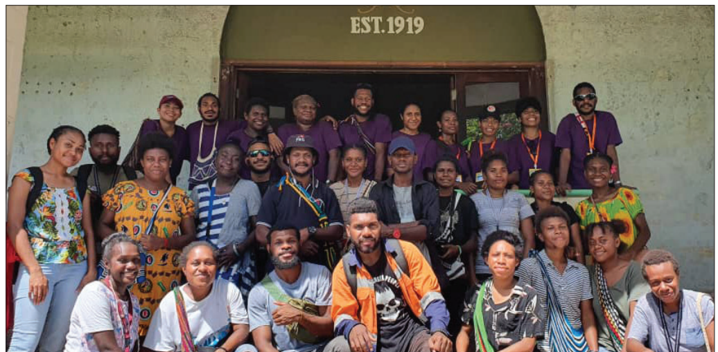
▲ The students at the Rabaul Historical Society's Museum at the New Guinea Club.

Fourth-year Bachelor of Sustainable International Tourism students recently led a small group of tourists on a land tour of Rabaul.