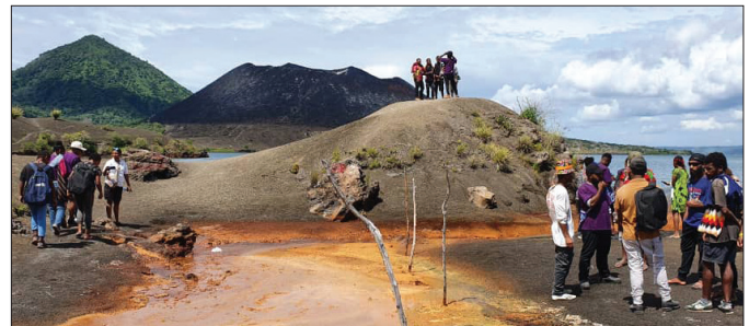
▲ At the Hot Springs at the foot of Mt Tavurvur.

"Their 'tour groups' consisted of first-year BSIT students undertaking SIT111 Introduction to Tourism . As 'tourists', they had to rate their tour guides out of 18 stars, and the ratings counted towards the BSIT4 students'