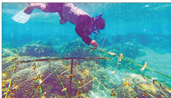
▲ Removing algae on line beds nursery platforms,

Nursery platforms consist of mesh table platforms, coral trees and line beds, which corals are attached to and placed under 3 – 10 m below sea level. Currently, there are 400+ macro-fragmented corals planted on the nursery platforms.