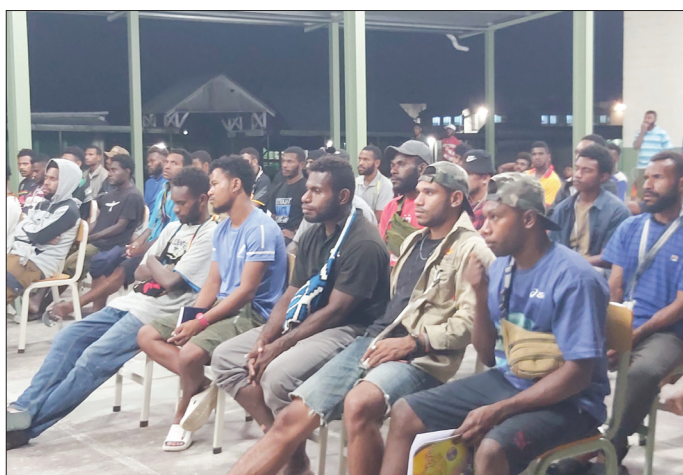
▲ Students at the night session last week.

Giving an example, he explained that the two new programs at the School of Environment and Climate Change (SECC) - Environment and Climate Change and Renewable Energy and Environmental Engineering are yet to be accredited by DHERST. This